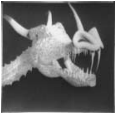
Dragon - Image of a dragon on a FLC 512x512 analog SLM modulating along the positive real-axis.

The drive electronics support frame rates of 1015-Hz, or 2-kHz with the high speed option, and can be interfaced to a multitude of data sources. The simplest is the computer PCI-bus interface for loading data from the computer memory or disk. The driver can also be interfaced to off-the-shelf image processing boards or to custom data drivers using a high-speed data port that supports the full 1015-Hz new-image frame rate.