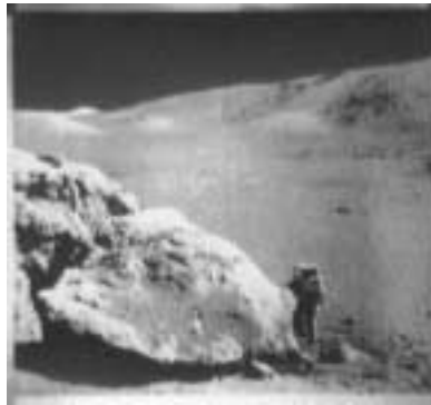
Apollo 17 - Image from the Apollo 17 mission on a FLC 512x512 analog SLM modulating along the positive real-axis.