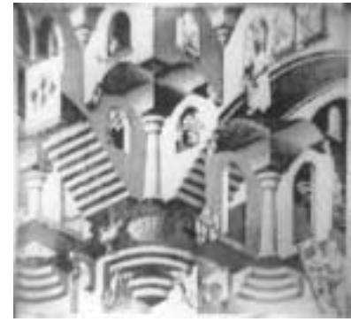
Escher - Escher drawing on a FLC 512x512 analog SLM modulating along the positive real-axis.